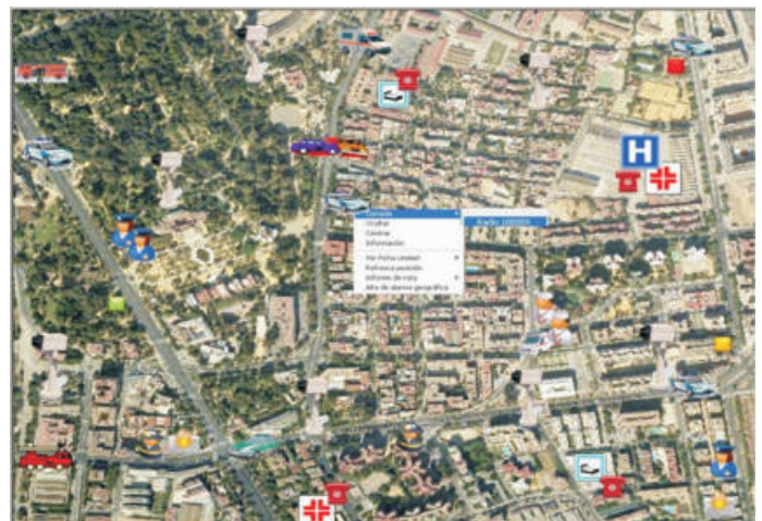
Figure 1: Integration of sensor data in GIS