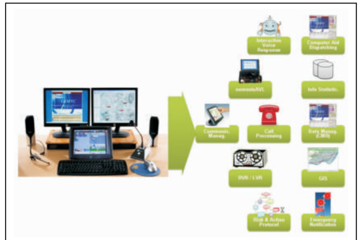
Figure 4: EMS Components

With increasing traffic and larger road networks, more sophisticated sensors will need to be deployed: traffic radar sensors, single/double loop detectors, etc. A C4ISR solution will allow data feeds from these sensors to be integrated with those from existing sensors.